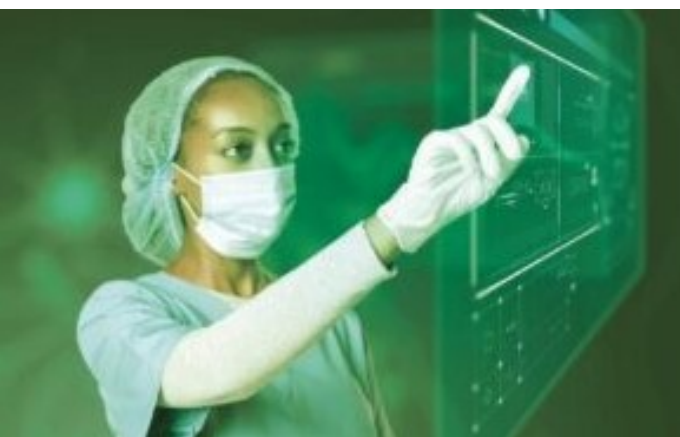
Africa CDC recently launched the Trusted Health Initiative to revolutionize digital health in Africa.