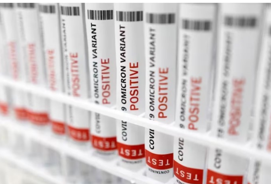
La OMS declaró variante de interés a la cepa BA.2.86 del SARS-CoV-2 surgida en agosto pasado en los EEUU