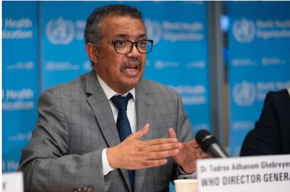
Desde la OMS instaron a seguir de cerca a la nueva variante

Pese a todo esto, los expertos en variantes prefieren “moderar ese optimismo” y advirtieron que si BA.2.86 todavía está evolucionando, uno de sus descendientes podría recuperar suficiente aptitud para convertirse en una fuerza a tener en cuenta.