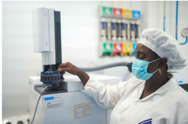
A lab worker at Atlantic Lifesciences in Ghana.

“We are grateful for the incredible close collaboration with the African Union and Africa CDC in support of our shared vision of a thriving, sustainable African vaccine ecosystem” added David Marlow, Interim CEO, Gavi, the Vaccine Alliance. “AVMA is an important step forward, sending a powerful signal that GAVI is serious about its efforts to support this vital initiative.”