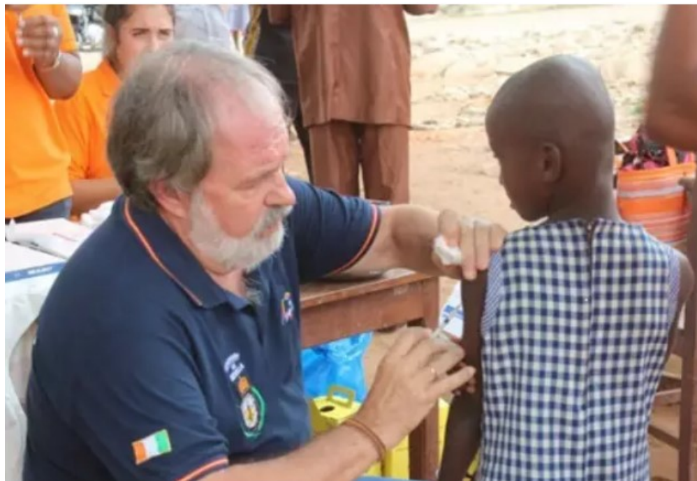
Un sanitario pone una vacuna a un menor de Costa de Marfil.

La ONG también impulsó la creación de un colegio en ese país africano con la ayuda de la Fundación Cajasol y la Diputación de Sevilla.